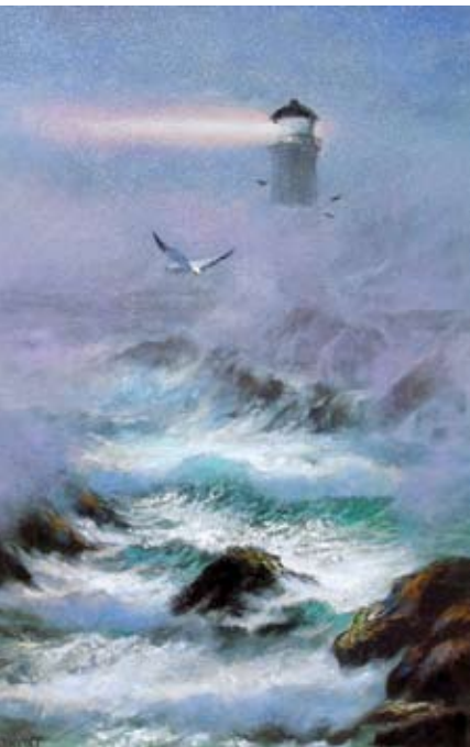
Incoming Fog 24x18

Parkhurst has been featured more than 200 times in vari-