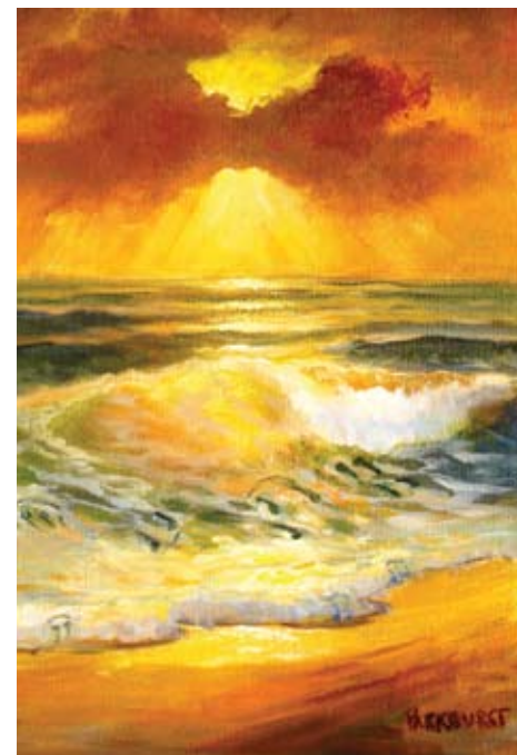
Notes in Sand and Surf 24x18