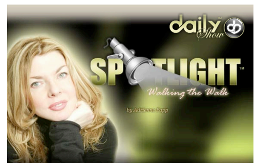
Spotlight™ by Adrienne Papp on Chictoday.com Daily Show