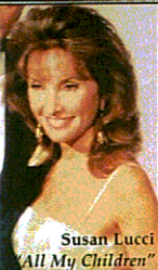
Susan Lucci All My Children

Los Angeles Mayor Antonio Villagarosa took time off from running the City of Angels to make a very special appearance at the Red Carpet Arrivals of SOAPnet and The Academy of Television Arts & Sciences Annual