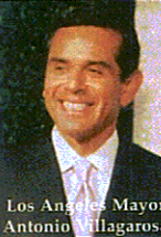
Los Angeles Mayor Antonio Villagarosa

Daytime Emmy Awards Nominee Party. The Mayor was a shoe-in with the 2006 Daytime Emmy Award nominees and was all smiles for his camera-ready arrival on the red carpet... very Hollywood appropriate. After all... Tinseltown is his kind of city!