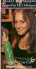
VERGLO Everglade "Glo Girl" Representative