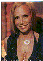
Model Cindy Margolis draped in Mc2 Designs