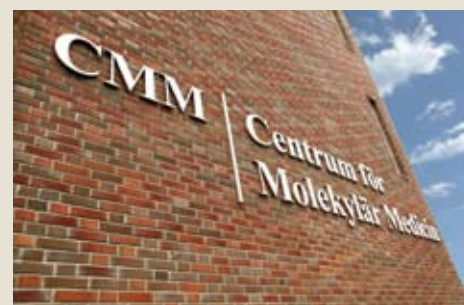
Centre for Molecular Medicine at Karolinska Institutet

ing out a very different approach. “Our mission is to change the way the world deals with overweight issues” he adds. “Big pharmaceutical companies spend millions of dollars on clinical trials to support a claim on a drug, which then turns into large profits; but less than one percent of all products in the world sold as dietary supplements or nutraceuticals (nature’s natural) can demonstrate a high-level of clinical background and scientifically documented effects.”