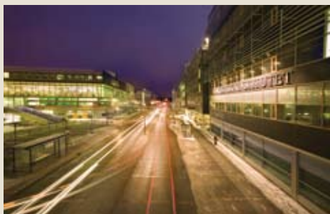
Karolinska Institutet in Sweden

On any given day in our diet-frenzied society, about half the women and a large portion of men are dieting. Combined with bad nutritional habits and thousands of different diets and diet pills, people fall prey to the diet yo-yo, also known as weight cycling, resulting in negative