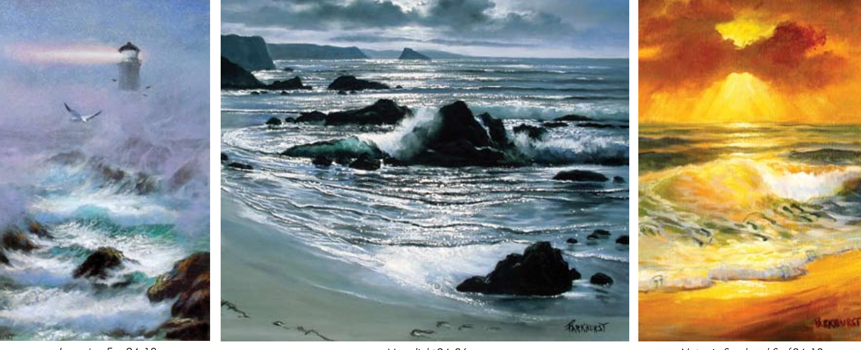
Incoming Fog 24x18

Parkhurst has been featured more than 200 times in vari-